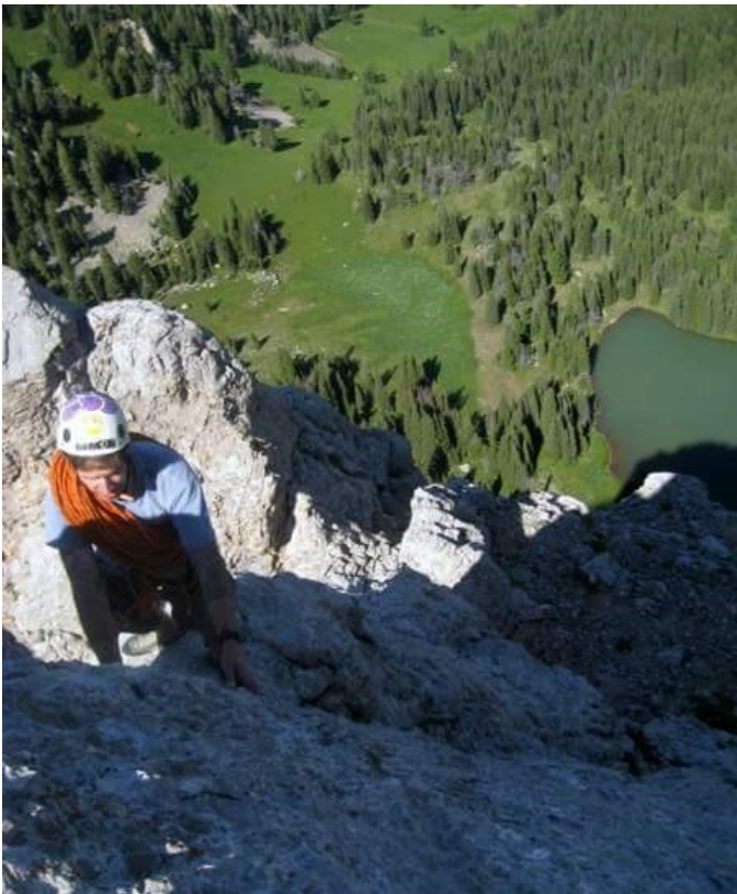
Soloing the last pitch of a multi-pitch climb in the Northern Bridger Range, Montana.