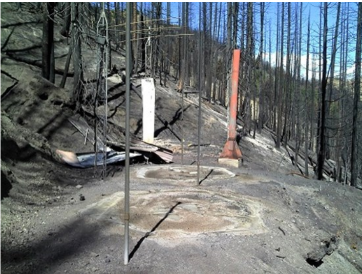
After the fire, little remained of the site.