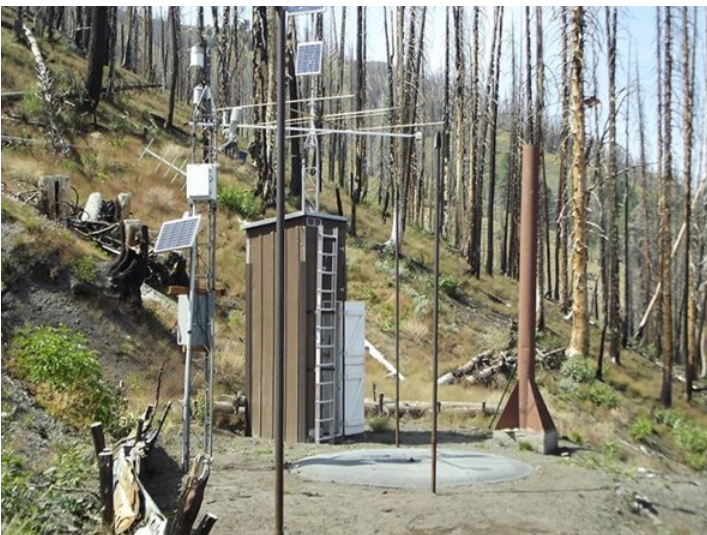
Dollarhide Summit SNOTEL site today.