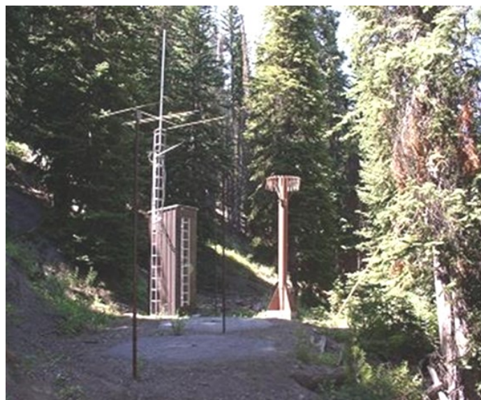
Dollarhide Summit SNOTEL site before the August 2013 fire.