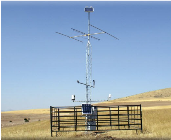
Blue Creek SCAN site, northern Utah.