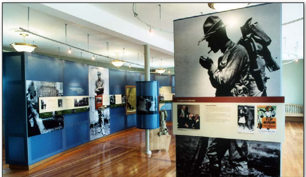
Fort Des Moines Museum