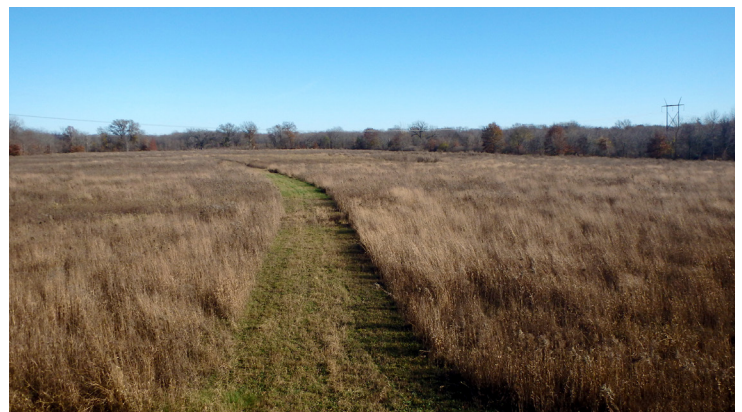
A firebreak helps to control prescribed burns in this native planting.