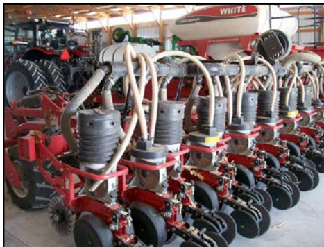
Narrow row or split-row planter

Narrow Row Planting: Many split-row or narrow row planters (15" row width or less) can be equipped with seed plates, such as those used for sugar beets or sorghum, which work well for many cover crop species. Additional adaptation and/or calibration may be necessary due to variation of seed size among cover crop species and varieties. This method should provide the fastest and most consistent emergence and is recommended for seeding species during the final days of the approved seeding period. To improve crop diversity at least two species of cover crops could be planted either in alternating rows or combined together. This method should not be used if weed control is the primary purpose. Seed at the drilled/incorporated rate. (See Table 1)