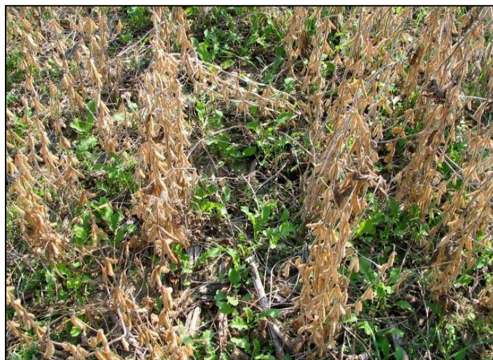
Aerial Inter-Crop Seeding - established in standing soybeans

Aerial Inter-Crop Seeding: Broadcast via a plane, helicopter or high-clearance spreader into existing vegetation or standing crops. This method relies on rain, freeze/thaw cycles, or snow to incorporate the seed. Timing in the fall should be just prior to leaf drop or early crop maturity stage for most cover crops. This method may provide more timely seeding for species that require an earlier establishment. Some shade tolerant species may be adapted to earlier seeding. Earlier seeding is desirable when the cover crop is to be used for fall forage. An attempt should be made to seed just ahead of predicted rain. Seed at broadcast on surface rate. (See Table 1) Only seed mixes of species with similar density should be considered. Aerial applicators should be knowledgeable of the spreading width and the weight of the planned species. Wind speed should be 15 m.p.h. or less when broadcasting. It does not include a seedbed preparation. In dry years, this method may provide poor or inconsistent emergence compared to planting or drilling.