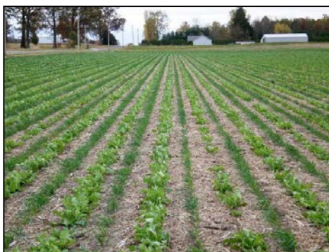
Two species of cover crops growing in alternating 15" rows.

Harrow Seeding: Rotary harrows, coultter harrow type vertical tillage tools or similar tools can be used to aid in fluffing or cutting residue to allow improved seed to soil contact over broadcasting alone but may lack the depth control of planters and drills. Air delivery seeders can be mounted to these tools to deliver the seed to the soil as the residue is lifted or cut. The implement will be set to run no deeper than 1" and not be designed to invert the soil or to bury the crop residue. Coultters will be set to run straight and not be cupped or concave. Tools with multiple operation gangs should only utilize the coultters with the rear harrow gangs raised or detached. This prevents excessive soil disturbance and moisture and carbon