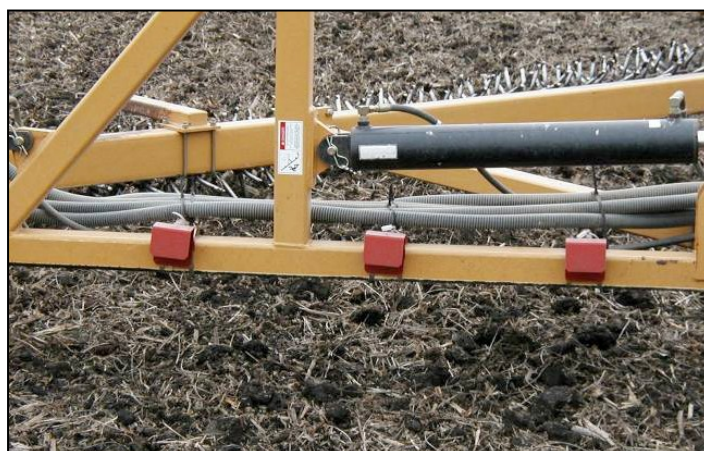
Rotary Harrow Seeding - seed delivery ports