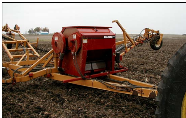
Rotary Harrow Seeding - mounted air delivery seeder in light crop residue

loss that will reduce the desired benefits of the cover crop. This will be a fast, single pass operation, that can seed many acres in a short period of time. Seed at the incorporated rate. (See Table 1)