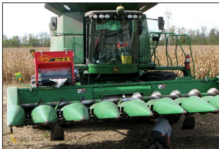
Air seeder mounted to corn head

Other approved Innovations: Air delivery seeders can be mounted to combine heads to deliver the seed to the soil as the residue is being cut or shredded. As the residues exit the back of the combine they are spread as mulch over the seed to allow improved seed to soil contact and emergence rates over broadcasting alone. Mixes with smaller seed size may be preferable to reduce seed hopper filling frequency. Seed at drilled/incorporated rate. (See Table 1) Additional seeding innovations are likely and should be evaluated on a case by case basis.