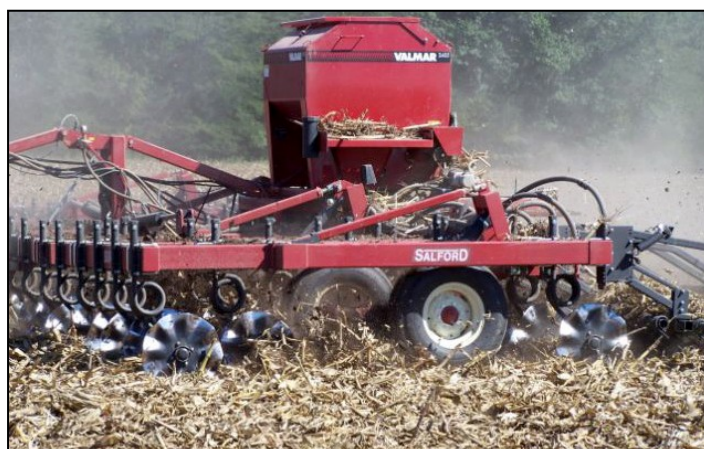
Coultter Harrow (vertical tillage tool) Seeding - air delivery seeder on a coultter harrow in heavy crop residue