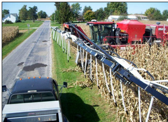
High-Clearance Sprayer, converted to air seed cover crops