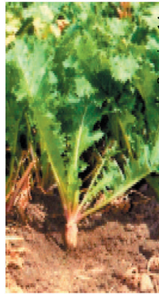
Leafy-7 Top Lower Forage Yield Lower Bulb Yield