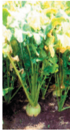
Forage Turnip High Forage Yield Low Bulb Yield