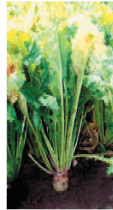
Globe Medium Forage Yield Medium Bulb Yield