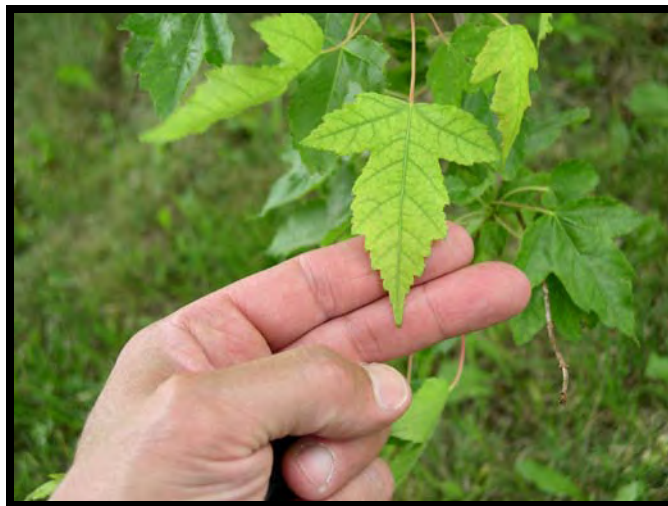
IRON CHLOROSIS IN AMUR MAPLE CAUSED BY HIGH SOIL PH

Listed in TABLE 2 are soil pH classes. Since soluble salts affect soil pH and vice versa, pH is often included in evaluations and discussions of soil saltiness. Changing the soil pH often results in a corresponding change in plant nutrient availability. The availability of certain nutrients in soil solution begins to decrease above pH ~5.5 (iron [Fe], manganese [Mn], zinc [Zn], copper [Cu], cobalt [Co]), above ~7.0 (phosphorus [P], boron [B]), and above 8.5 (calcium [Ca], magnesium [Mg]). The soil pH scale ranges from 0 to 14, with <7 considered acidic, 7 neutral, and >7 alkaline or basic. Most arable soils in our region have a pH in the range of