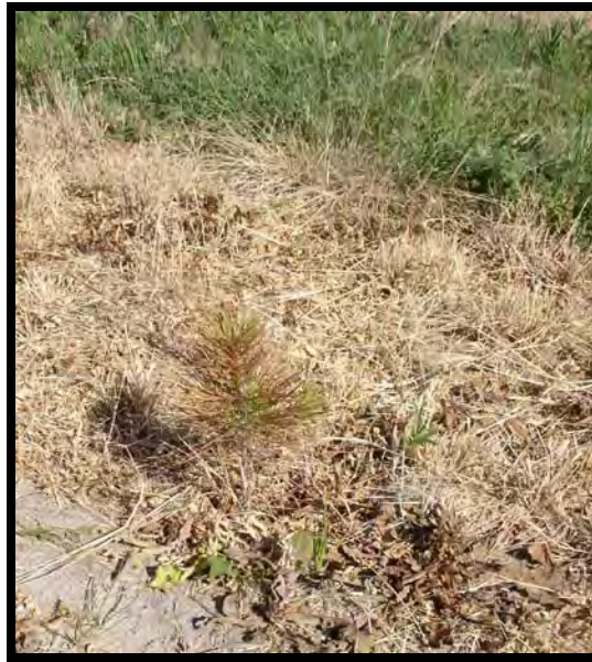
NEEDLE NECROSIS IN PONDEROSA PINE CAUSED BY HIGH SOIL SALINITY

These values are only approximations of salinity tolerance; actual tolerance may be less depending on field conditions. Also, see Conservation Tree/Shrub Suitability Groups (CTSG) in Section II, Windbreak Interpretations in the Montana FOTG or eFOTG (see References) for a list of tree and shrub species adapted to salt-affected soils.