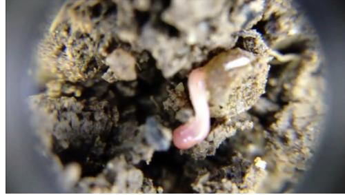
Worm being born within the pore space of a well-aggregated soil.

When these two principles are properly applied as part of a soil health management system, soils can maintain or even increase SOM content as well as enhance nutrient cycling.