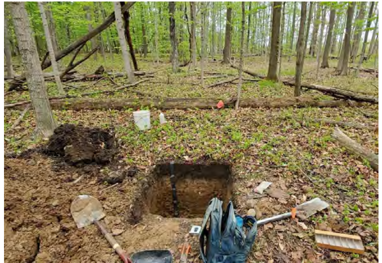
A reference site in northern hardwoods forest is described and sampled.(above).

(Crosier, Metamora, and Capac) that formed on the same landscape were also evaluated.