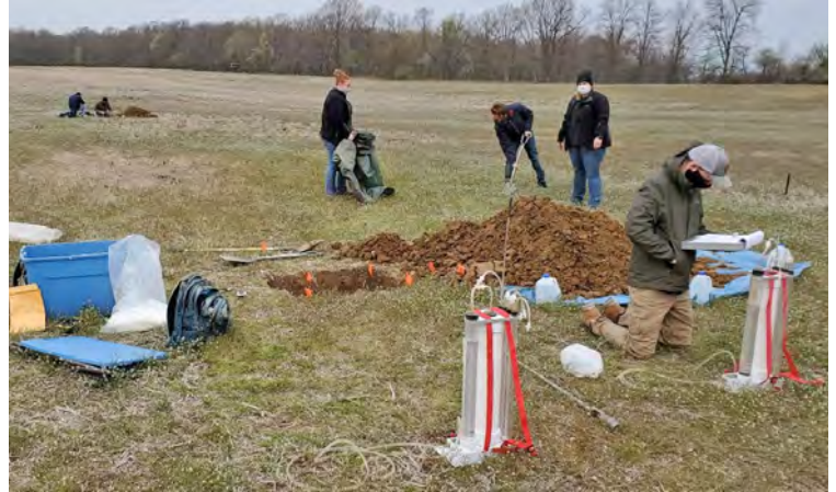
Multitasking: central and satellite pedons are sampled while worm counts and Amoozemeters are recorded (above).

Important dynamic soil properties and health measurements assessed included surface infiltration, soil compaction, bulk density, organic carbon content, earthworm populations, aggregate stability, beta-glucosidase and other enzymes, plant available phosphorous, total nitrogen, saturated hydraulic conductivity, and more. The main soil series evaluated was the Conover series (fine-loamy, mixed, active, mesic Aquic Hapludalfs) that formed in loamy glacial till parent material on the large till plain landscape in central Michigan. Similar, somewhat poorly drained soil series