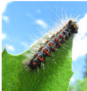
Gypsy moth larva on oak leaf (above left) Gypsy moth larva killed by Nuclear Polyhedrosis Virus.

Originally published on Michigan Forest Pathways , sponsored by Cookhouse Productions, Michigan Forest Association, Michigan State University Extension, and Michigan Technological University.