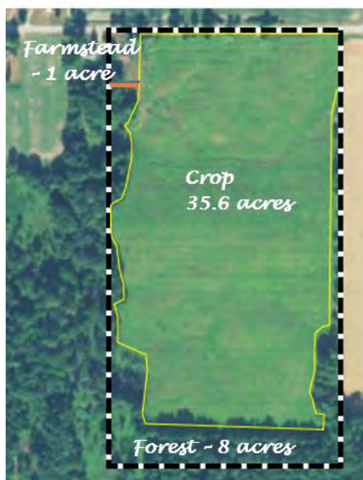
A sample delineation map.

the field office in determining eligibility for the program and developing your application so accuracy is important. Many applicants provide the Farm and Tract maps from FSA, but other maps, like those from your agronomist or farm management software, may have the required elements and can be used.