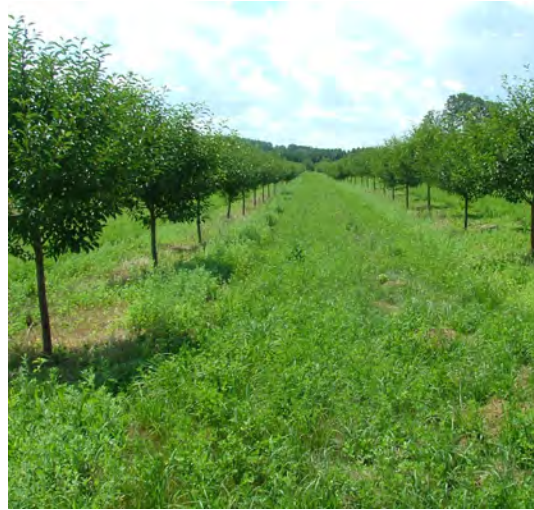
All types of farming and private forest operations are eligible to be enrolled in CSP.

Your field office can assist you with the definitions. Highlight any areas that you are unsure of and discuss with your field staff.