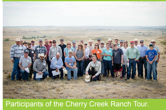
Participants of the Cherry Creek Ranch Tour.