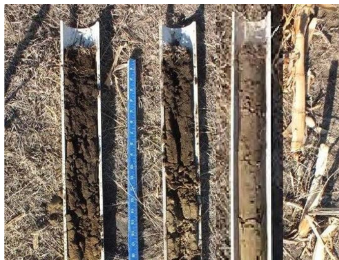
Changes in soil organic matter due to differences in management.

-reduces the negative water quality and environmental effects of pesticides, heavy metals, and other pollutants by actively trapping or transforming them.