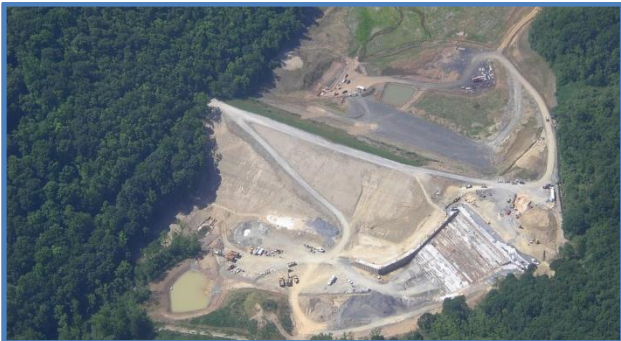
Rehabilitation construction began in 2011.

The dam was constructed by local watershed project sponsors with the assistance of the USDA Natural Resources Conservation Service (NRCS) Watershed Protection and Flood Prevention Program. It is one of eight constructed dams in the New Creek Watershed Project. Three dams in the project plan have not been constructed.