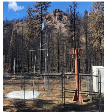
Spratt Ck SNOTEL after rebuild