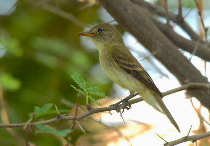
U.S. Fish and Wildlife Service photo of the southwestern willow flycatcher.

Total NRCS Investment .....$9,507,432 Number of Contracts.....124 Total Acres Contracted .....48,413