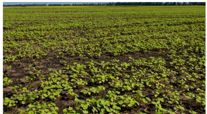
Buckwheat sprouting up in a field.