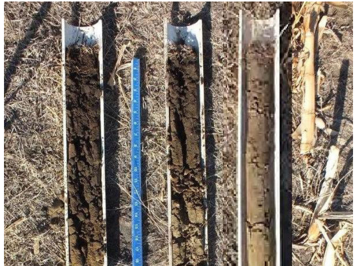
Changes in organic matter due to differences in management.