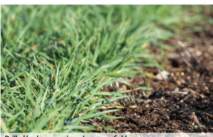
Drilled barley grows in an lowa crop field.