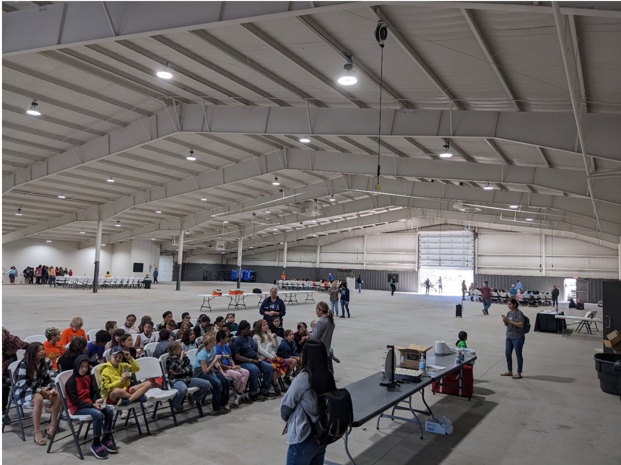
Figure 3.—The expo center set up for presentations for the Jackson County Ag Youth Day event