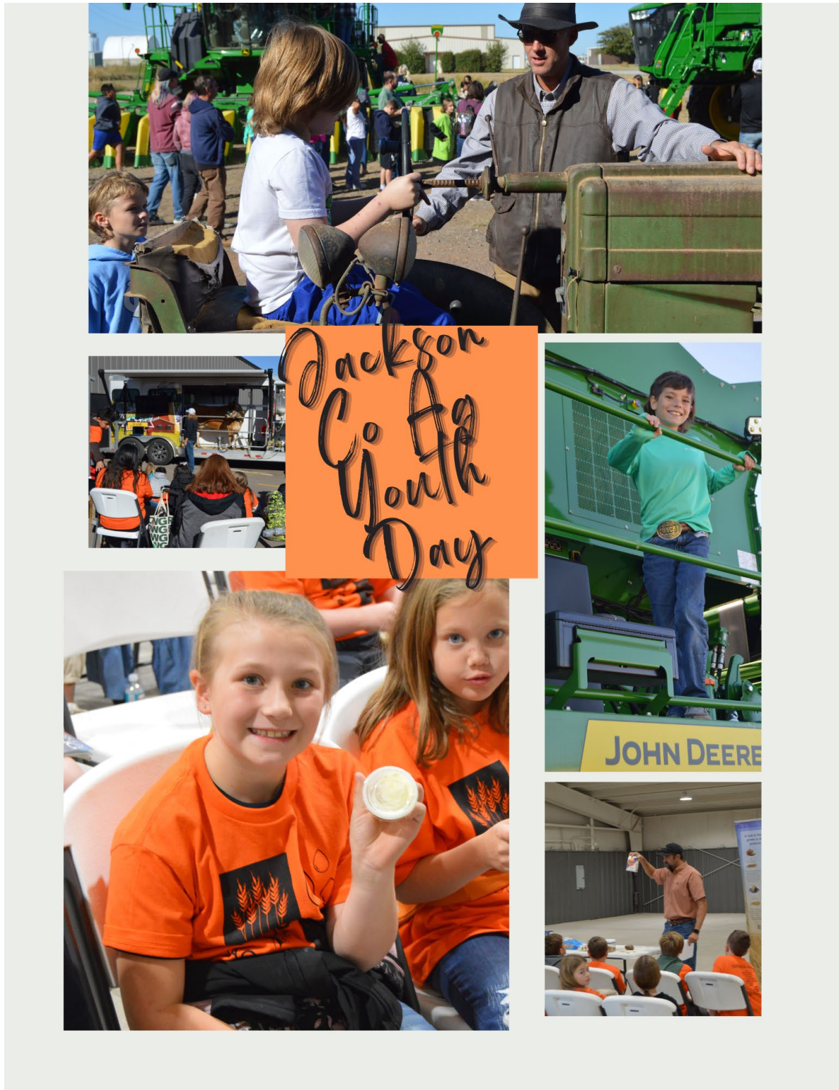
Figure 2.—Students explored farm equipment and displayed butter they had made during the Jackson County AG Youth Day event.