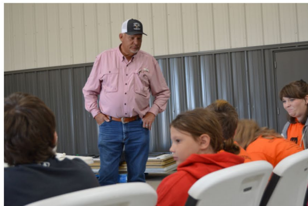
Figure 1.—Presenters discussed their topics to students during the Jackson County AG Youth Day event.