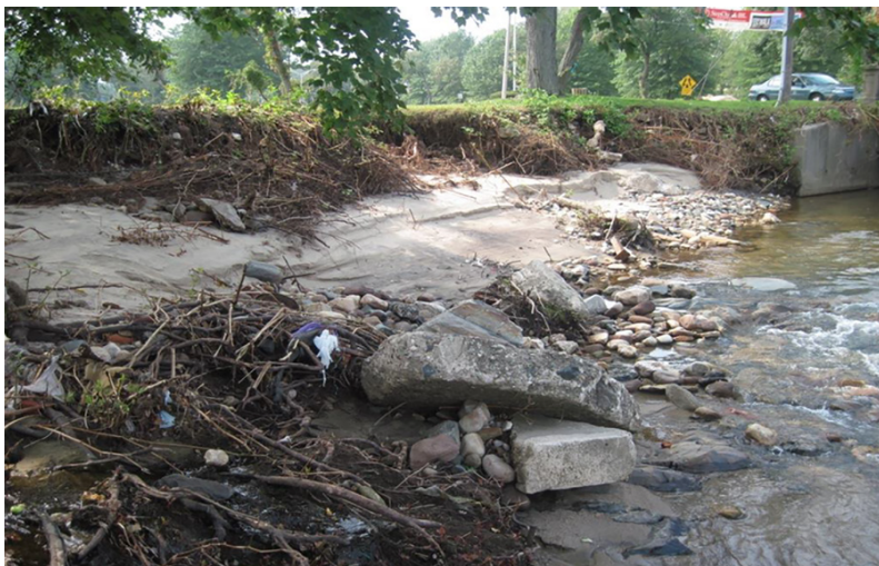
EWP - Flood Plain Easement stream restoration (BEFORE)