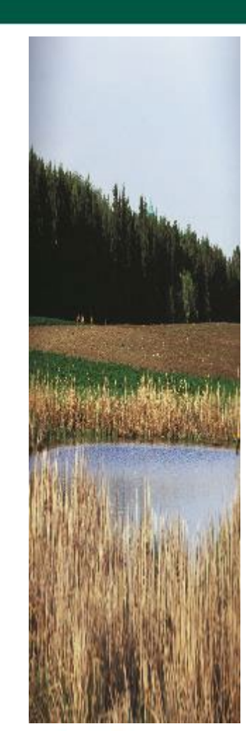
Farm Service Agency

Note: After the May 13, 2022 deadline, the offers will be National ranked. Upon receipt of the accepted and rejected offers list, County Offices will notify producers with offer status.