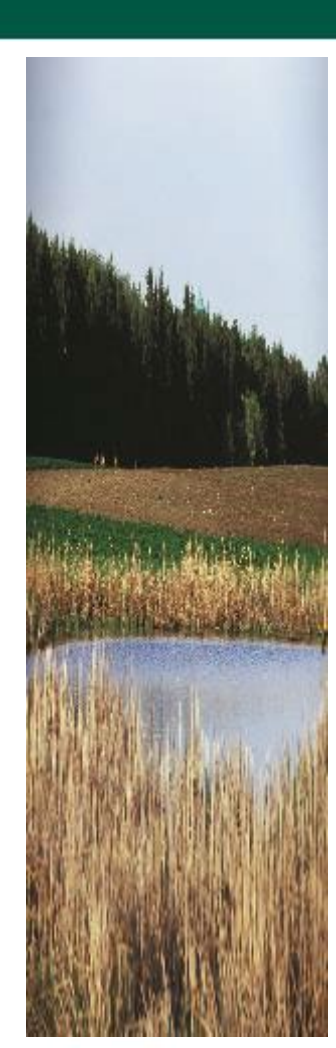
Farm Service Agency