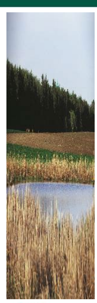
Farm Service Agency