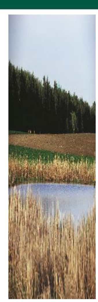
Farm Service Agency