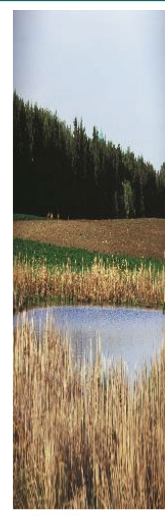
Farm Service Agency