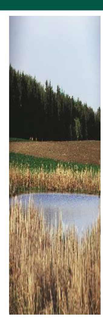
Farm Service Agency