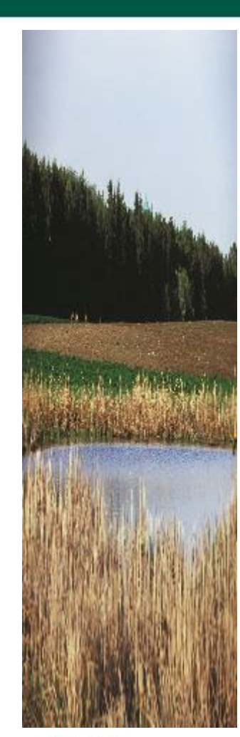
Farm Service Agency