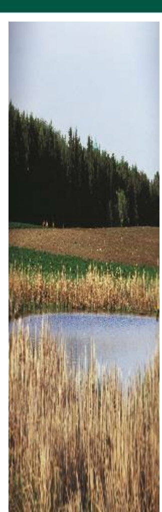
Farm Service Agency