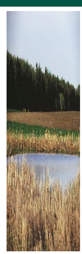
Farm Service Agency