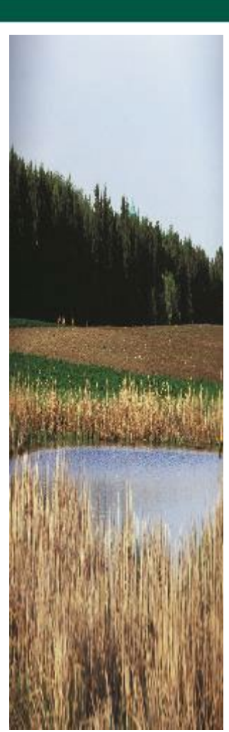
Farm Service Agency