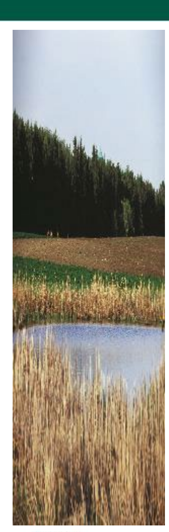
Farm Service Agency

Note: Incentives may not be applicable to all practices.