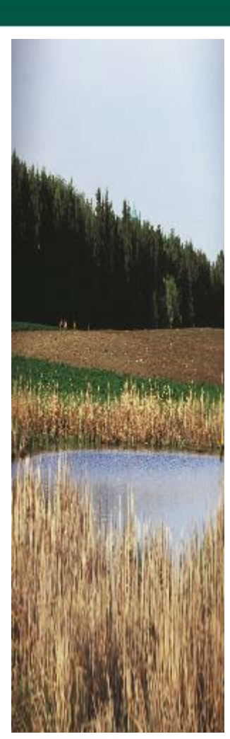
Farm Service Agency

Deadline to submit proposals is June 23, 2022.