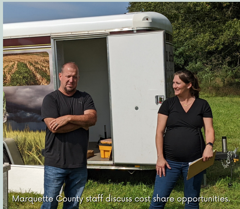
Marquette County staff discuss cost share opportunities.