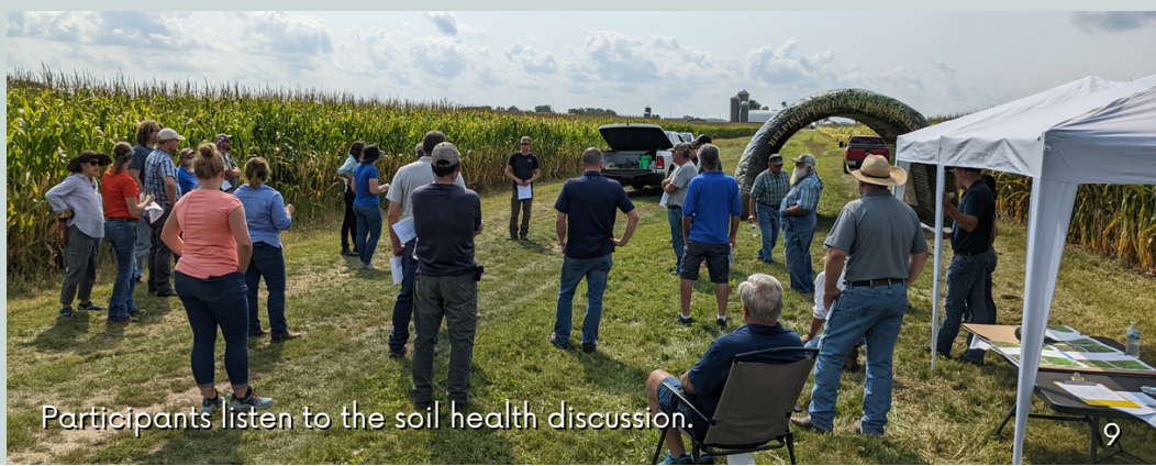
Participants listen to the soil health discussion.