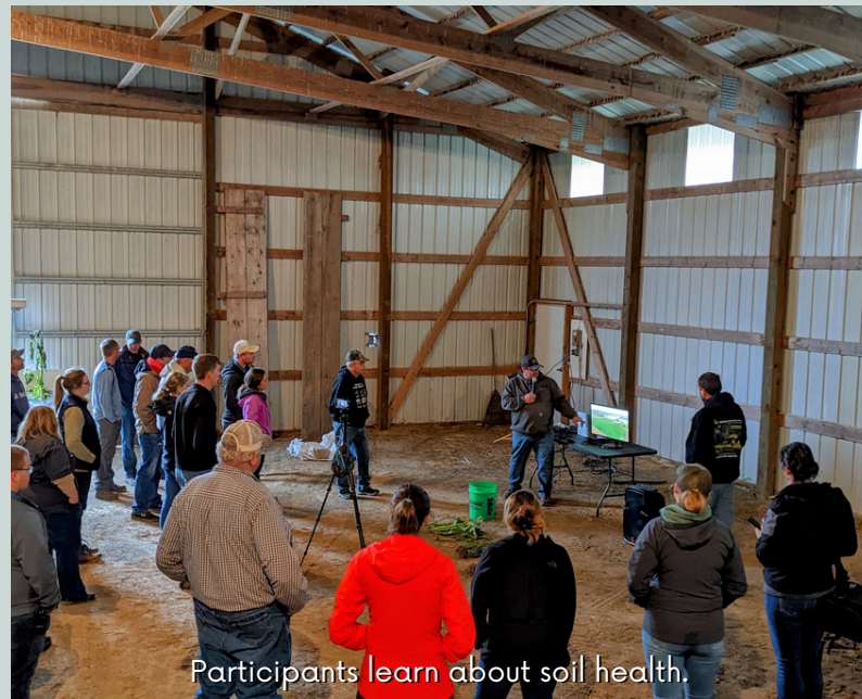
Participants learn about soil health.