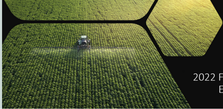
2022 Farmer Roundtable Evaluation Findings

The UFW demo farm team assisted in planning and hosting the 2022 farmer roundtable, and conducted an evaluation of the event.