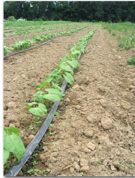
Drip Irrigation System

Traveling gun systems have the advantage of covering large field areas with each pass, but the high pressures at which they operate will cause you to spend more on fuel. In addition, large sprinkler water drops may damage some crops.