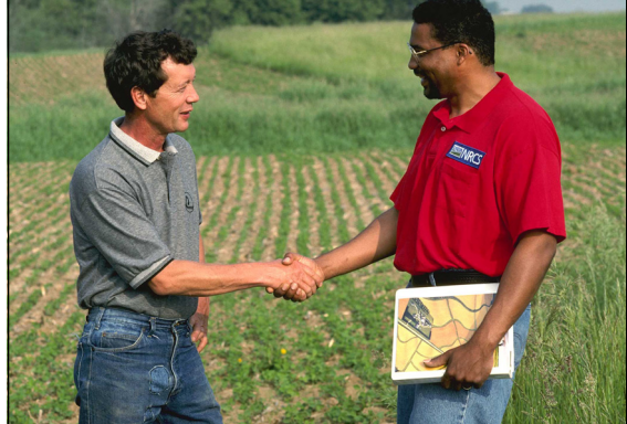
Helping People Help the Land

There is no charge for our assistance. Simply call your local office at the number listed below to set up an appointment and we will come to your farm.