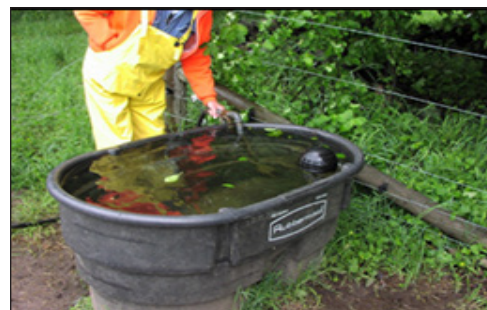
Heavy duty plastic water trough