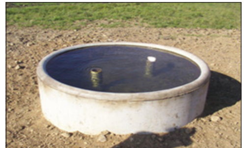
Permanent concrete water trough