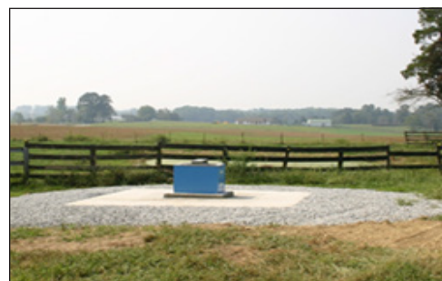
Freeze proof waterer