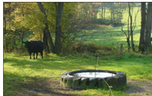
Heavy equipment tire water trough