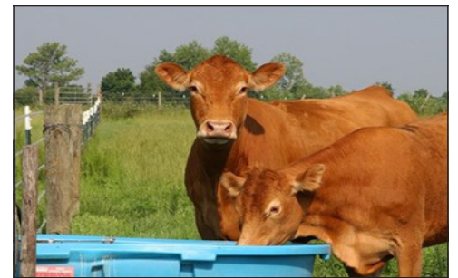
Locate watering facilities in more than one place in a pasture to prevent overuse of one area.