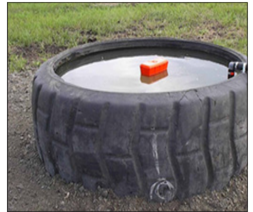
Heavy equipment tire waterer