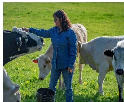
Clean dry animals do not smell as bad.