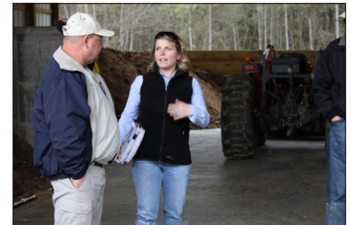
Working with your local specialist will be critical to manage odor issues on your farm.