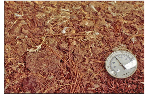
Properly composted material is not a source of odor.

Manure storage ponds and tanks can be a source of strong odors. Covers over a manure storage can reduce odors. Various types of covers are available.