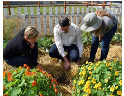
NRCS conservationist assisting small scale farmer with developing a customized conservation plan.

To file a program discrimination complaint, complete the USDA Program Discrimination Complaint Form, AD-3027, found online at How to File a Program Discrimination Complaint and at any USDA office or write a letter addressed to USDA and provide in the letter all of the information requested in the form. To request a copy of the complaint form, call (866) 632-9992. Submit your completed form or letter to USDA by: (1) mail: U.S. Department of Agriculture, Office of the Assistant Secretary for Civil Rights, 1400 Independence Avenue, SW, Washington, D.C. 20250-9410; (2) fax: (202) 690-7442; or (3) email: program.intake@usda.gov .