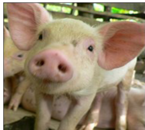
Dirty, manure-covered animals can help accelerate bacterial growth.