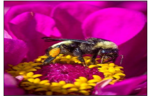
Adult butterflies feed on nectar and pollinate crops.