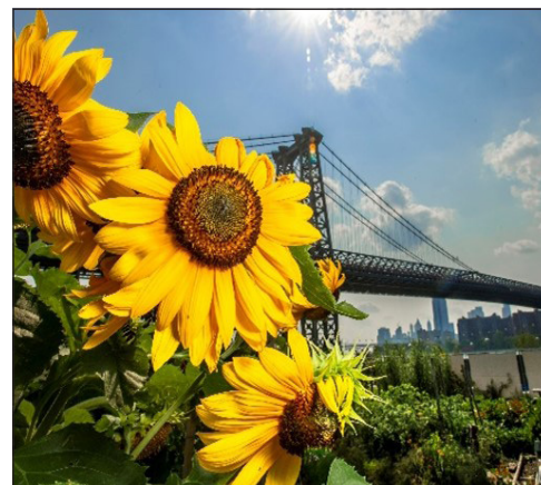
Native pollinators have the greatest impact in crop production.