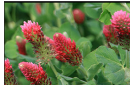
Clover cover crops can provide habitat for pollinators.