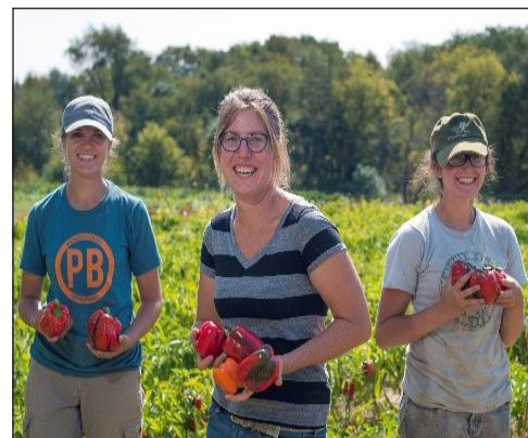
Crop production and quality is impacted by pollinators.