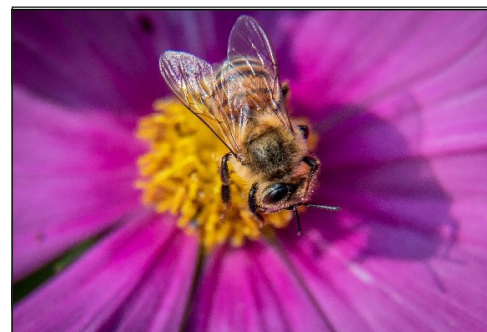
Natural areas provide supplemental food sources to all kinds of species.

Disking – Disc harrowing is a preferred method of disturbing the soil and vegetation. The only equipment needed is a tractor and disc harrow. The blades on the harrow should be set as straight as possible.