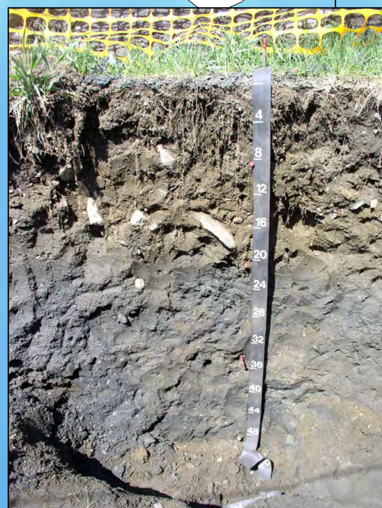
Newport soil formed in dense glacial till derived from dark colored materials of the Narragansett structural basin.