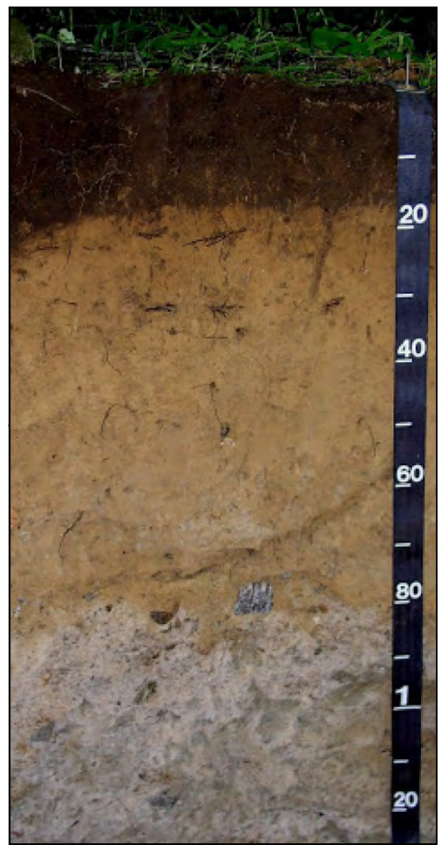
Narragansett soil is formed in windblown silts (loess) over ablation till. This unofficial Rhode Island state soil is a prime farmland soil.