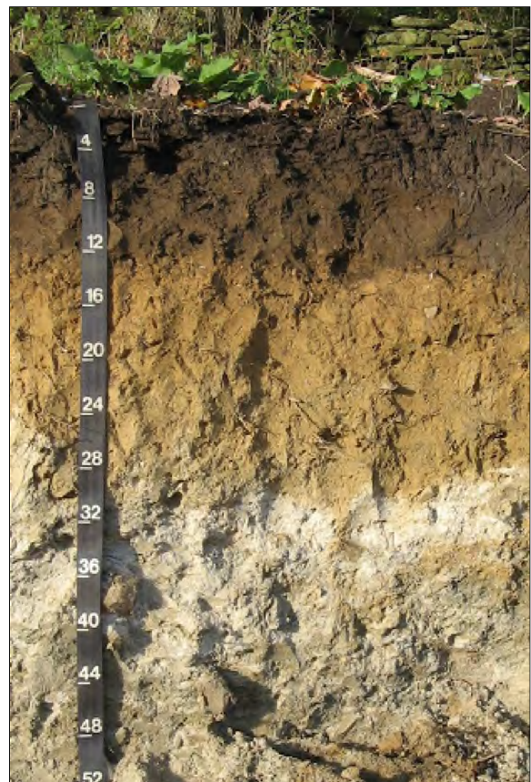
Canton soil formed in sandy ablation till. This well-drained soil is found in association with finer textured Charlton soils and is common in the northwestern part of Rhode Island.