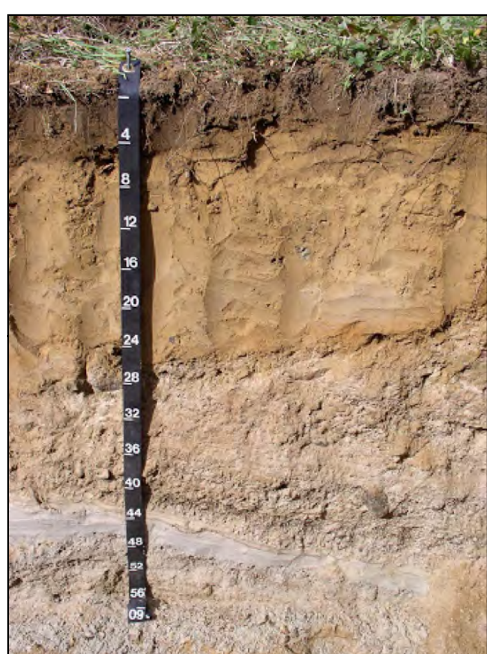
Enfield soil formed in stratified sand and gravel outwash with a silt loam windblown loess surface. The finer materials at the surface make this a prime farmland soil.