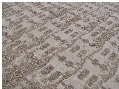
ACBs installed in repair of Lake LaMoure aux. spillway