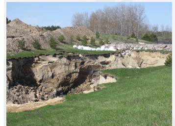
Erosion of aux. spillway at Lake LaMoure

Many river banks along the tributaries of the Red River suffered substantial erosion due to the saturate banks and elevated flow velocities. A number of EWP projects were implemented and constructed to provide protection to both life and property