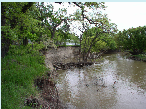
Bank erosion along the Sheyenne River near Ft. Ransom, North Dakota

Your local NRCS office can provide more details on a specific situation.