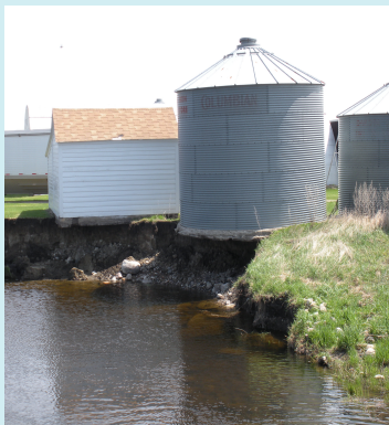
Streambank erosion threatening infrastructure in LaMoure County, ND along Bone Hill Creek