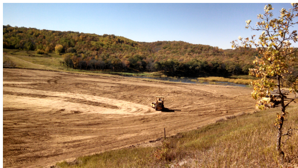
Repair of aux. spillway for Bourbanis Dam in Cavalier County

Non-Exigency Project —The threat to life and property constitutes an emergency, but does not pose an imminent threat. Non-exigency projects must be completed within 220 days after funding approval.