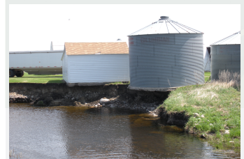
Threatened infrastructure along Bone Hill Creek

EWP Working for North Dakota Communities