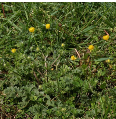
Tall/Common buttercup

Cursed crowfoot is a plant of marshes, ditches, and swampy meadows. It ranges from Newfoundland and Quebec to Alaska, south to Virginia, Kentucky, Missouri, New Mexico and California.