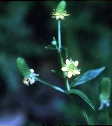
Cursed Crowfoot Photo by: Robert H. Mohlenbrock Hosted by the USDA-NRCS PLANTS Database

Usually found in moist, open pastures and meadows