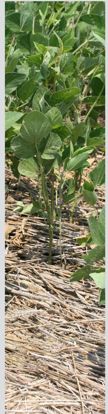
No-till soybeans in stubble.

The Soil Tillage Intensity Rating (STIR) was used to calculate the soil disturbance intensity for each crop grown in each of the previous 3 years of management at each sample point of the NRI-CEAP-Cropland farmer survey period (2013–16). STIR is a function of the kinds, frequency, and depths of tillage. Tillage management and conservation tillage adoption was assessed on a crop-by-crop basis for each cropping system. Management of each crop was classified according to the average annual STIR values for the implements used to produce the crop. For each implement used, fuel consumption was estimated assuming the same moisture conditions, recommended speed, and tractor horsepower. The fuel use in diesel equivalents was averaged for the rotation within each tillage classification. The fuel consumption requirements for each implement used were based on a standard developed by the Nebraska Tractor Test Laboratory (NTTL) and available at: tractortestlab.unl.edu/nebraskatractorlabpublications and through ASAE (ASAE Standards, 2002a, 2002b). Emission reductions from fuel savings are based on the U.S. Department of Energy (DOE) Energy Information Administration's estimate that a gallon of diesel fuel emits the equivalent of 22.4 pounds of CO 2 emissions ( eia.gov/tools/faqs/faq.cfm?id=307&t=11 ).