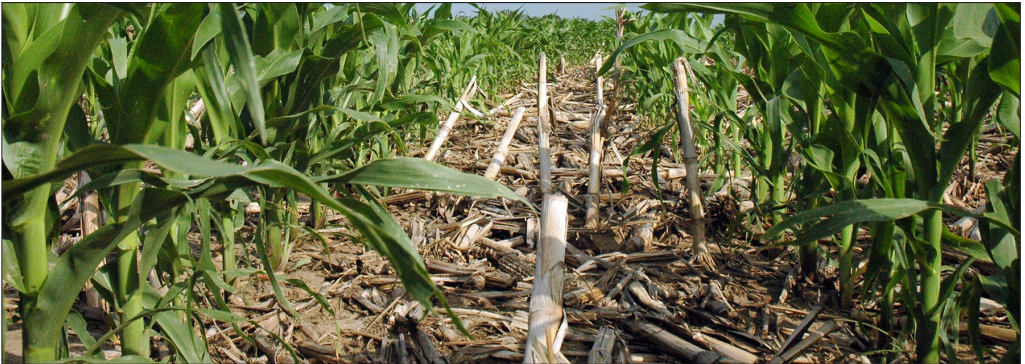
Corn planted into no-till corn residue.