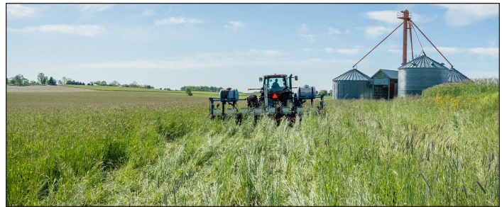
Tilling disturbs soil and is time consuming and expensive. During the process, tractors burn fuel and emit carbon dioxide (CO 2 ) and other greenhouse gases and pollutants. Conservation tillage used in 2013–2016 is estimated to have saved the CO 2 equivalent emissions of nearly 1.7 million cars.

The STIR values for each crop in a crop rotation were used to determine to which tillage consistency class the survey point and its weighted acres belong (the classification definitions are provided on the next page); the national weighted average for each tillage classification is presented in Table 2. Fuel savings and emission reductions by tillage classification (see table below and