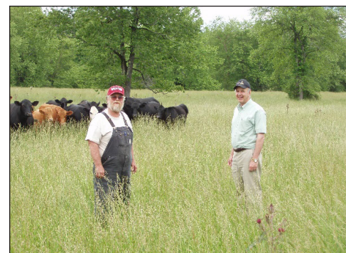
An example of Pine Silvopasture system.