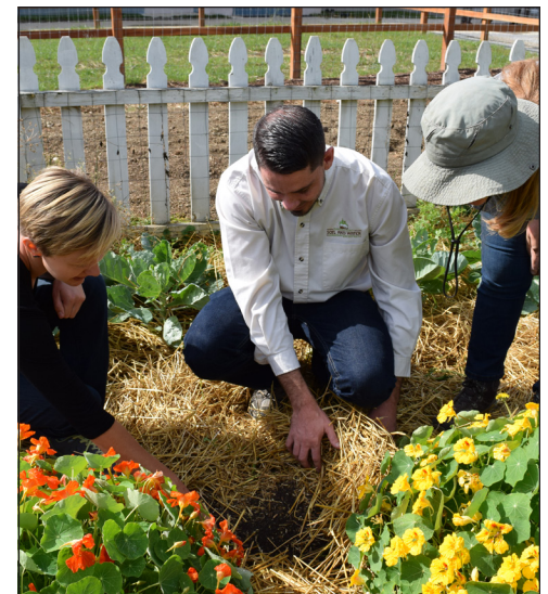
NRCS partner assisting small scale farmer with developing a customized conservation plan.

Visit the Natural Resources Conservation Service or visit farmers.gov/service-locator to find your local NRCS office. You can also check with your local USDA Service Center, then make an appointment to determine next steps for your conservation goals.