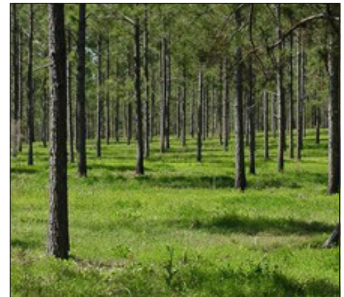
Pruning your woods can assist you diversify your operation.