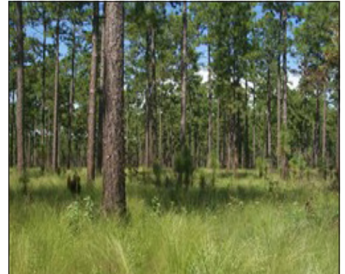
Managing your woodlands is important.