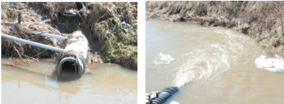
Figure 3: Two pipe outlets where frequent periods of submergence occur.