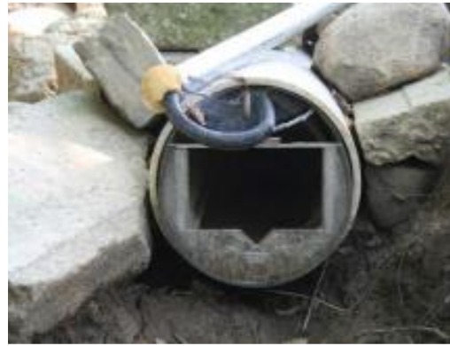
Figure 2: Subsurface tile drainage pipe with Thel-Mar compound weir.