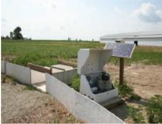
Figure 1: Edge-of-field surface runoff site with a 2.5 foot H-flume.

e Enclosure such as a calf hut with a propane heater will likely be necessary for year-round sampling in northern site.