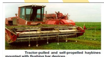
Tractor-pulled and self-propelled haybines mounted with flushing bar devices.