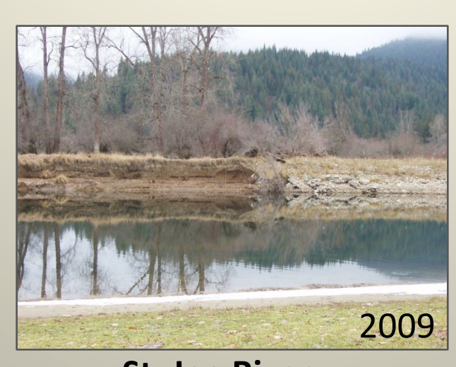
St. Joe River 978 cubic yards of sediment out of river (= 82 dump trucks )