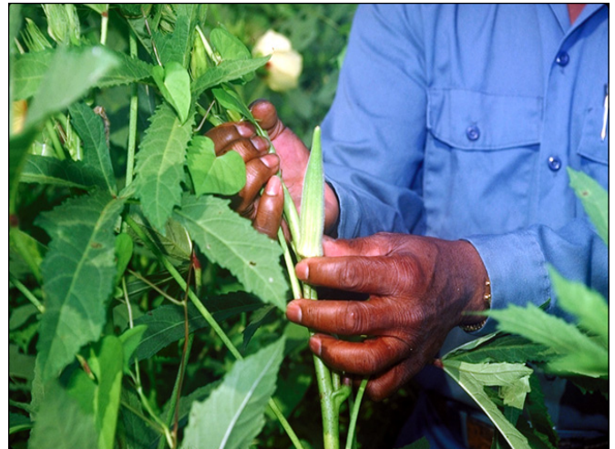
Rotations produce healthy and productive crops.