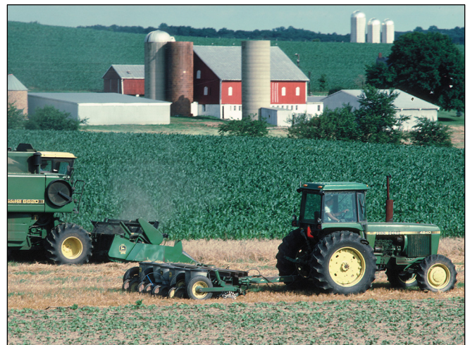
Rotations that include high residue crops build healthy soils and improve production.