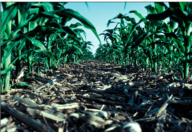
Rotations are planned to produce residue cover for erosion control and moisture conservation.