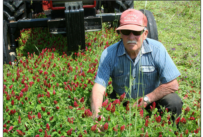
Rotations need to include crops that provide good cover and root development to control erosion and improve soil health.