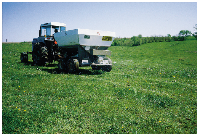
Rotations with hay or cover crops can reduce fertilizer and pesticide inputs.