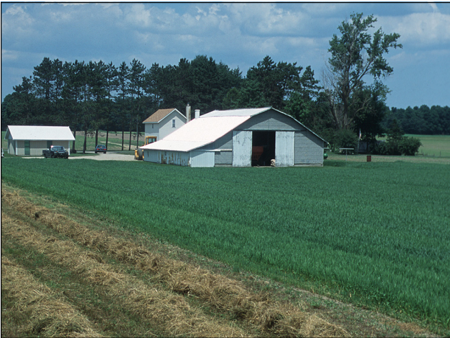
Multiple crops in a rotation break weed, insect, and disease cycles.