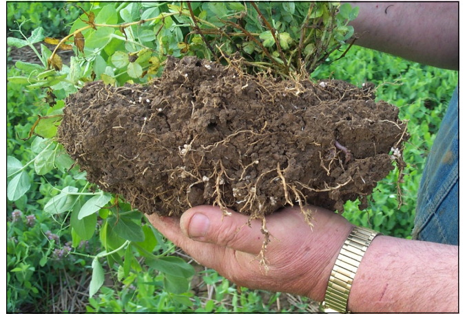
Rotations involving hay or cover crops improve soil