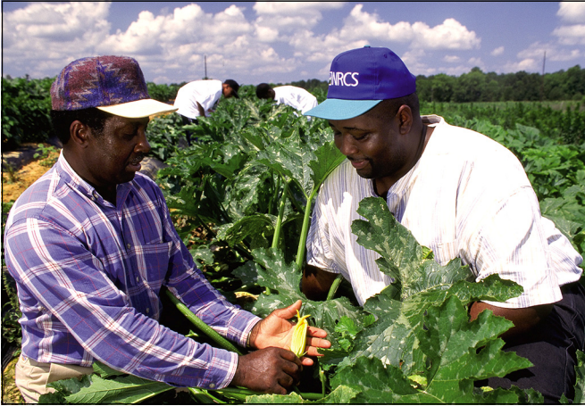
A good rotation begins with planning.