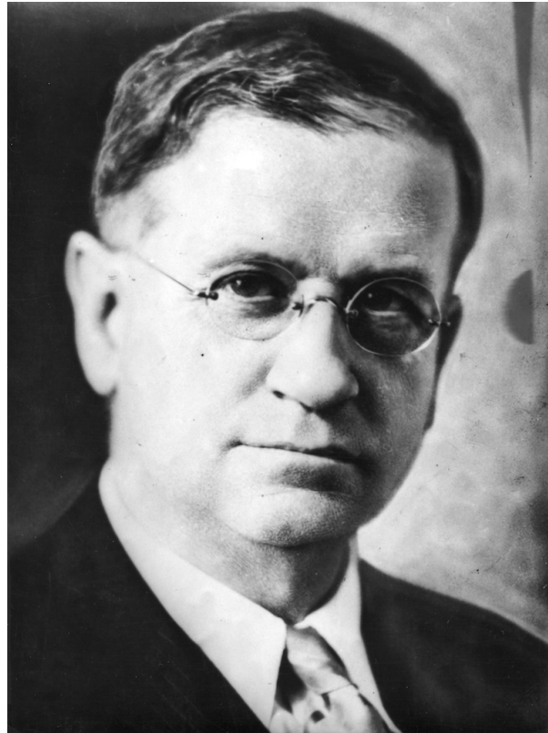
Secretary of Interior Harold Ickes

Wallace essentially made the argument to FDR that the "work of the