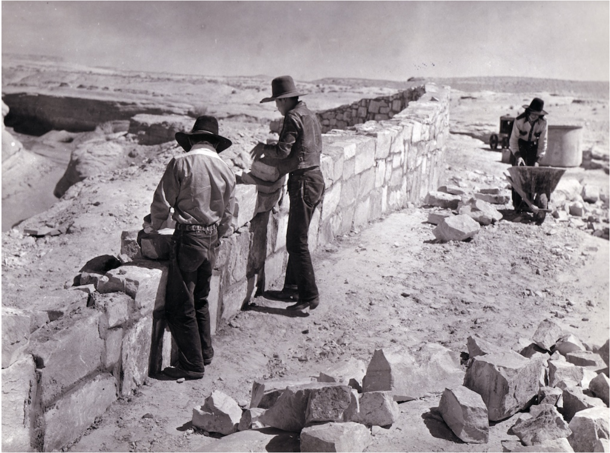
Navajo CCC workers build a diversion. Tuba City, Arizona

If the project could be put over successfully, as I believe it can, we would have demonstrated that wind erosion can be successfully controlled, and will have pointed the way to the prevention of this phenomenon which is so seriously affecting the agricultural and grazing lands of the western Mississippi Valley.