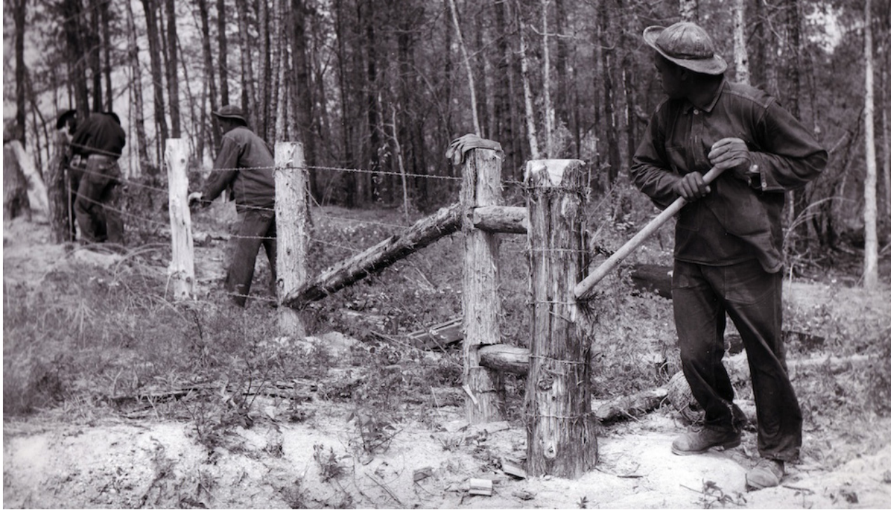
CCC enrollees building fences. Camp SCS-NC-5, Yanceyville, North Carolina. 35G No.287

the men who are surveying his Division? I don't want to hold up any work that he can legitimately do and I don't want him to have to lay men off, but, on the other hand, I don't want to permit the use of public funds for improper purposes. I wish there were some way of getting the answer to this whole question as soon as possible because if he is on the right track, he ought to be permitted to go ahead. 30