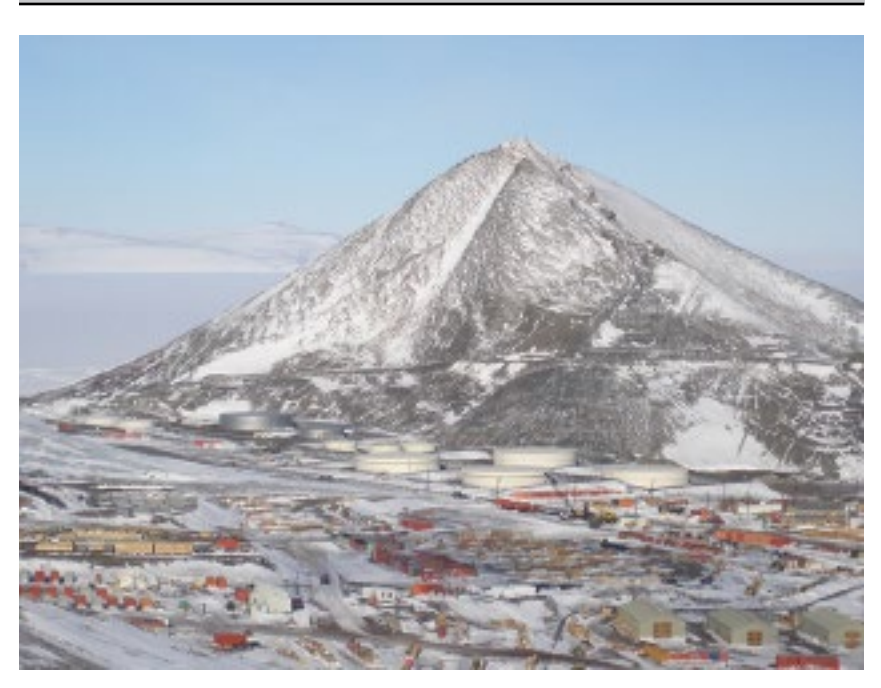
McMurdo Station, Antarctica. Human alteration of landforms, relocation of soil for building of infrastructure, and alteration of soil profiles occur even in this remote location.

not have long-term change, whereas a soil that was shaped into an agricultural conservation terrace is profoundly and intentionally altered for a long-term purpose. Some changes serve no useful purpose and can be judged as unintentional (e.g., cultivation can lead to wind or water erosion or salinization and discarded manufactured trash can end up in a plow layer).