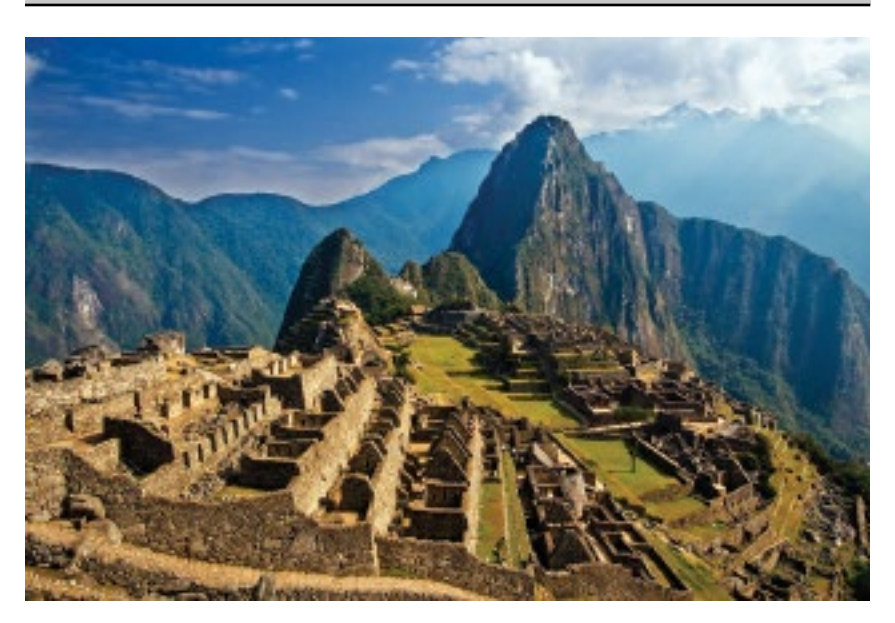
Machu Picchu, Peru. HAHT soils can be identified not only by diagnostic features in the soil profile but also by their association with anthropogenic landforms, whether manufactured items are found in the profile or not. This ancient urban area has geometric hillslope terraces on cut-and-fill landforms (foreground and lower right) created by humans in mountainous terrain to allow grazing, farming, and house building on formerly steep slopes. It demonstrates intentional human modification and transportation of soil.

horizons, impart manufactured materials and debris (artifacts) that become included in soil parent materials (fig. 11-3), and transport and deposit extensive amounts of soil, rock, and sediment that become new parent materials.