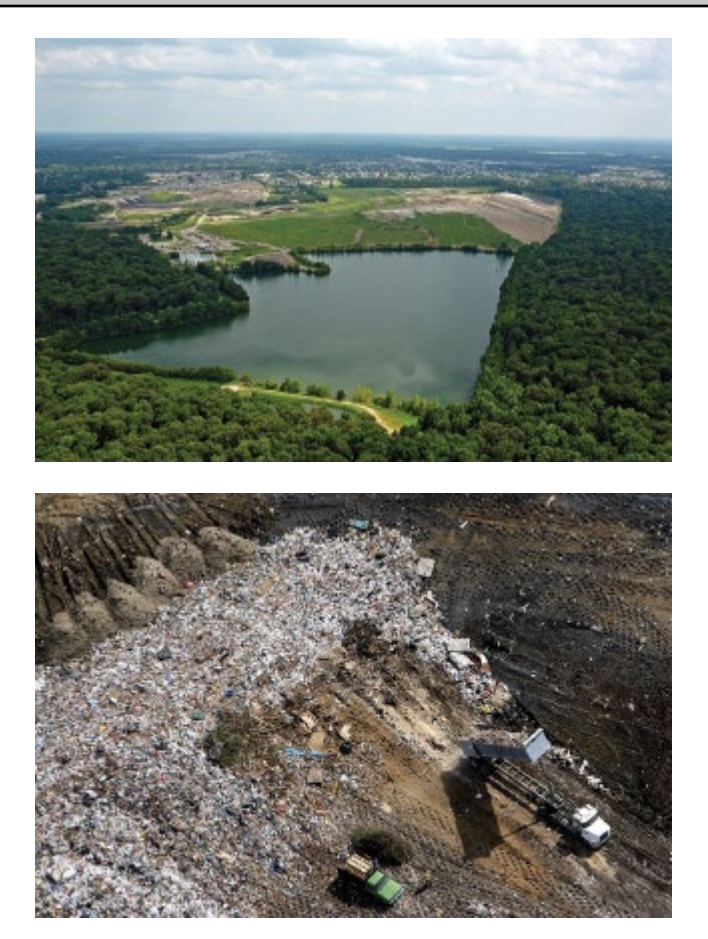
Top image—This landfill complex (center-right) is a constructional anthropogenic landform that rises approximately 33 m higher than the surrounding lower coastal plain swamp near Virginia Beach, Virginia. The geometric shaped excavation pit (now a lake) is an associated destructional landform. Both landforms are out of context with surrounding soils and landforms. Bottom image—The anthropogenic landform can be confirmed with edaphic and documented evidence of methane-producing garbage and artifacts layered between a geotextile membrane and soil material.

soil-forming factors (parent material, climate, organisms, time, and relief or topography), some authors (Dudal, 2005) have established a sixth factor, described as a "master variable capable of modifying or controlling the other five factors" (Amundson and Jenny, 1991). In particular, humans excavate deeply enough to remove most or all soil