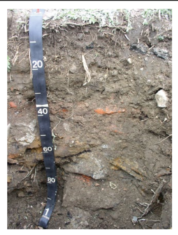
Profile of the Laguardia soil series showing artifacts in multiple deposits of humantransported material. The buried building debris contains brick, concrete, wire, steel, and asphalt.