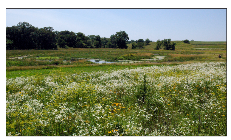
Wetland Wildlife Habitat Management