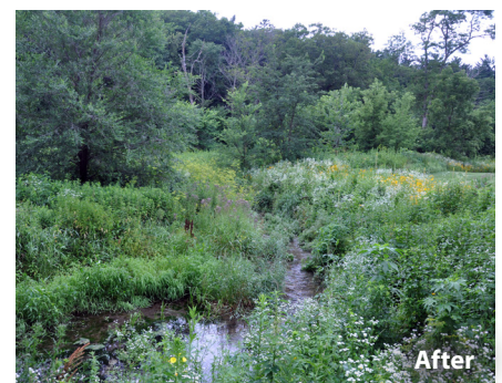
Restore your property after a natural disaster with NRCS' EQIP funding.