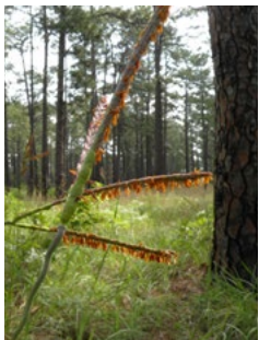
Forest Stand Improvement