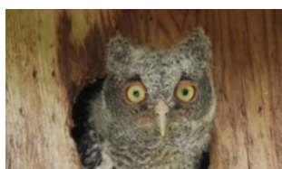
Structures for Wildlife