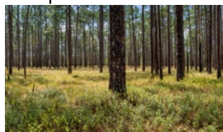
Early Successional Habitat Development