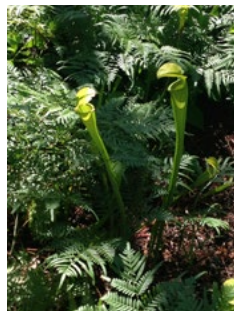
Restoration and Management of Rare & Declining Habitats