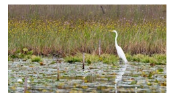
Wetland Wildlife Habitat