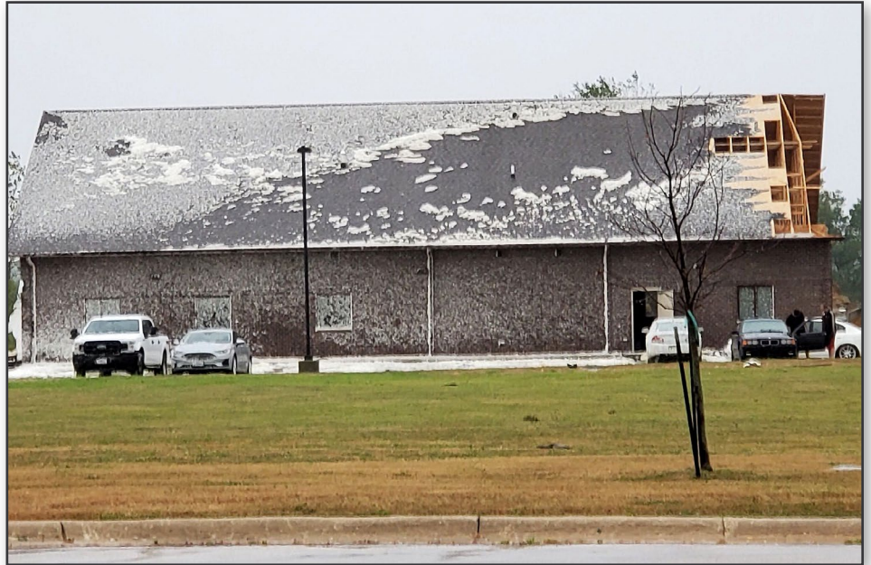
The Aug. 10 derecho storm nailed the Linn County USDA Service Center with straight winds in excess of 100 MPH. Portions of the roof were blown off, leaving insulation scattered about like a snowy winter storm.

Jaia Fischer, assistant state conservationist for management and strategy, says several other offices had minimal damage, but many NRCS, Farm Service Agency, and partner employees were without power for many days.