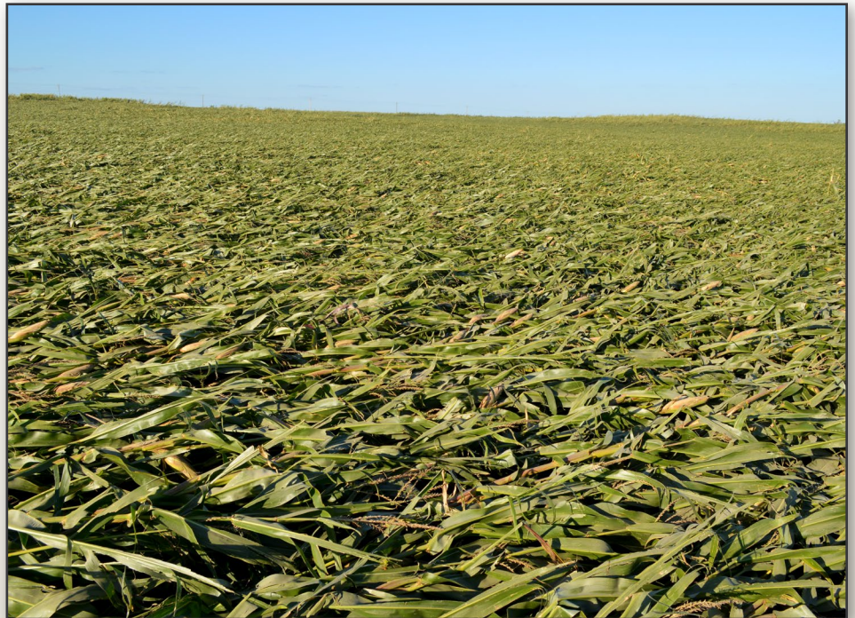
Iowa NRCS is requesting emergency conservation practice funds from National Headquarters to help producers treat resource concerns in 42 counties.