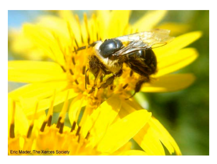
Sunflowers are a prolific summer bee plant for Illinois.

Similarly, is the new habitat located near existing pollinator populations that can "seed" the new area? For example, fallow areas, existing wildlands, or unmanaged landscapes can all make a good starting place for habitat enhancement. In some cases these areas may already have abundant nest sites, such as fallen trees or stable ground, but lack the floral resources to support a large pollinator population. Be aware of these existing habitats and consider improving them with additional pollinator plants or nesting sites.