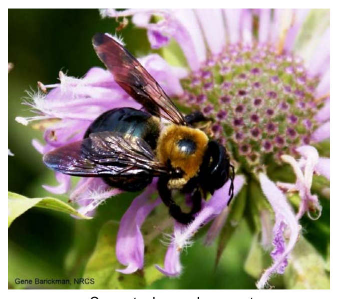
Carpenter bee on bergamot

Keep in mind that small bees may only fly a couple hundred meters, while large bees, such as bumble bees, easily forage a mile or more from their nest. Therefore, taken together, a diversity of flowering crops, wild plants on field margins, and plants up to a half mile away on adjacent land can provide the sequentially blooming supply of flowers necessary to support a resident population of pollinators.