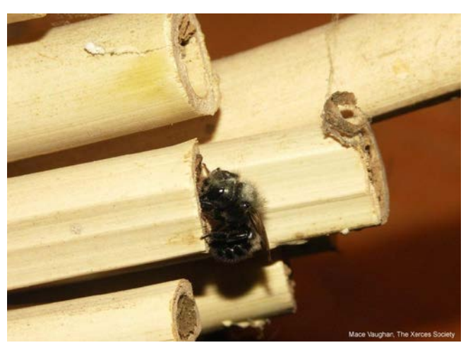
A mason bee closing the entrance to her nest with mud after laying a series of eggs in the tube.

While in most cases native plants are preferred, non-native ones may be suitable for some applications, such as annual cover crops, buffers between crop fields and adjacent native plantings, or short-term low cost insectary plantings that also attract beneficial insects which predate or parasitize crop pests. For more information on suitable non-native plants for pollinators, see the tables 3 and 4.