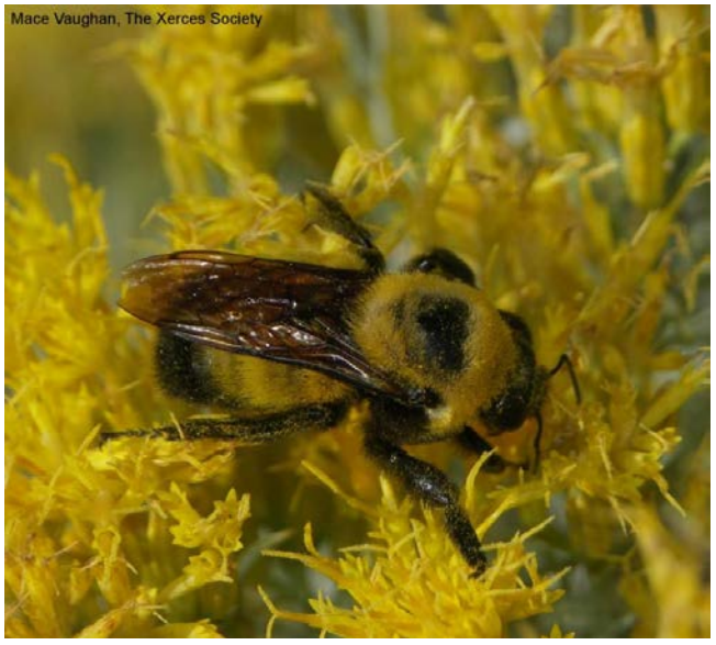
Bumblebee on goldenrod

Habitat enhancement for native pollinators on farms, especially with native plants, provides multiple benefits. In addition to supporting