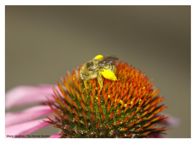
Native bee on purple coneflower.

The plants suggested below are all commonly available garden plants. These species will generally do best in a full sun location and may require supplemental irrigation and fertilization. Establishment of perennial plants may take a few years, but they will often last for an extended period of time. One strategy is to plant annual and perennial garden plants together, with the annual plants providing immediate benefits the first year, while the perennial plants become established.