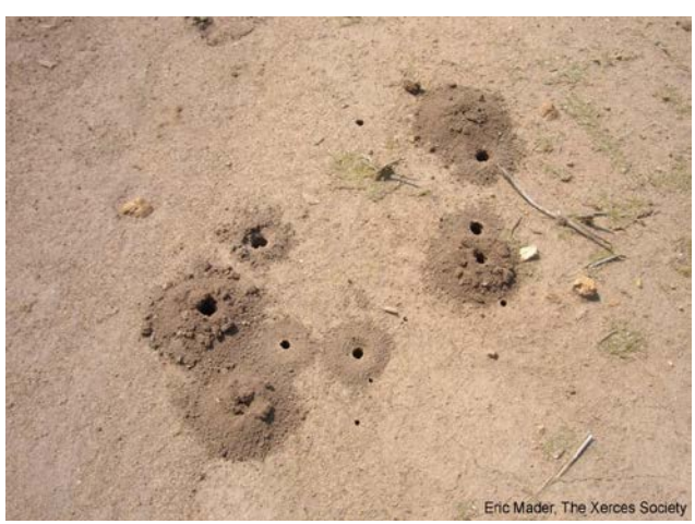
Entrances to these ground nesting bee nest resemble ant hills but have larger entrances.

Weed control alternatives to tillage include the use of selective crop herbicides, flame weeders, and hooded sprayers for between row herbicide applications.