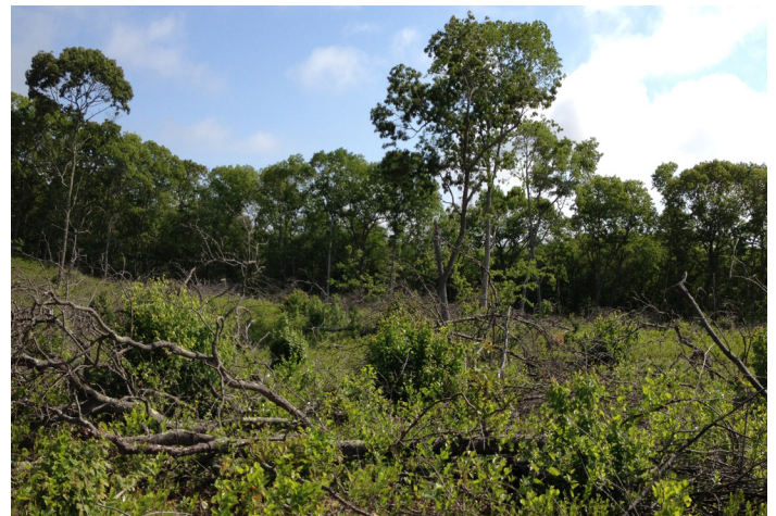
Conservation lands developing into shrubland habitat for the New England cottontail.

The New England cottontail ( Sylvilagus transitionalis ) relies on the early successional habitats of the Northeast for survival. Observed declines in the rabbit's populations have been linked to several factors including predation, competition from the Eastern cottontail and loss of habitat. Since the 1960s, these threats to the species have decreased the range of the rabbit by more than 80 percent compared to historic estimates. Conservation efforts focus on modifying forests to increase the population and range of the rabbit, in part, by planting shrubs and removing invasive plants.