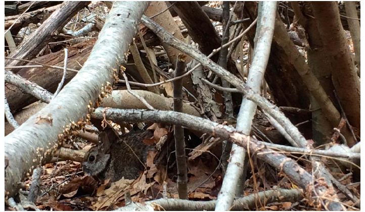
New England cottontail using woody groundcover as refuge.

The New England Cottontail Technical Group has created a targeted, science-based strategy to aid the species' recovery, relying on the support and participation of state and federal agencies, non-governmental organizations, private landowners, and others. This broad partnership has successfully established thousands of acres of early successional habitats throughout the Northeast, benefiting the New England cottontail and other wildlife species.