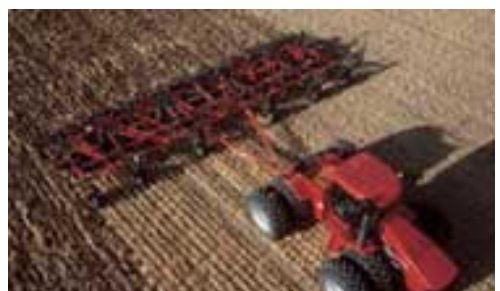
Field cultivation.