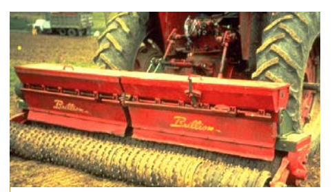
Cultipacker for legume crops.