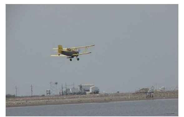
Aerial seeding a wetland restoration project.

seeding is suited for seedbeds that are loose, steep, and/or rough. Broadcast seeding rates are higher than drill seeding rates. Factors such as wind, difficult terrain, and machinery limitations impede seed distribution. Soil surface factors and predation limit the number of seeds that fall into safe sites. Most seeding guides recommend that broadcast seeding rates are double the drill seeding rates. In some instances, the rates may need to be adjusted even higher. However, increasing the seeding rate is a poor option to offset poor seeding technique. Always consider seedbed preparation options such as mulching before resorting to higher seeding rates.