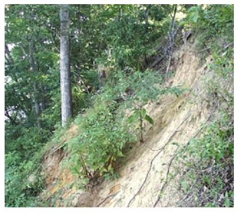
Severe erosion damage from poor water management such as this costs millions of dollars annually.

Conversely, some sites are low in moisture. Adequate moisture must be available during the establishment period. Placing soil and shaping can be very effective measures to hold water in the soil. Mulches can retard evaporative losses.