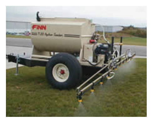
Hydroseeding a grass field.

Hydroseeding is preferred for slopes where drilling is not feasible and there is access to the area by trucks. A ready source of water and rapid method of filling the tank are necessary to achieve efficiency in operation. It is best to apply the seed and slow release fertilizer (if included) in one operation, followed by the fiber mulch in the second operation. When seed and mulch are applied together, much of the seed is hung up on the mulch where it cannot come in direct contact with the soil.