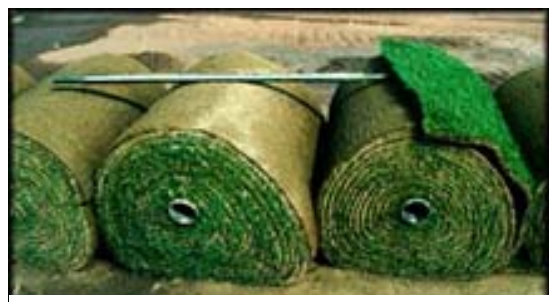
Grass sod cells ready to implant.

Sodding and sprigging are often the cheapest and most efficient methods on critical areas. Sod grown specifically for projects such as wetland restoration