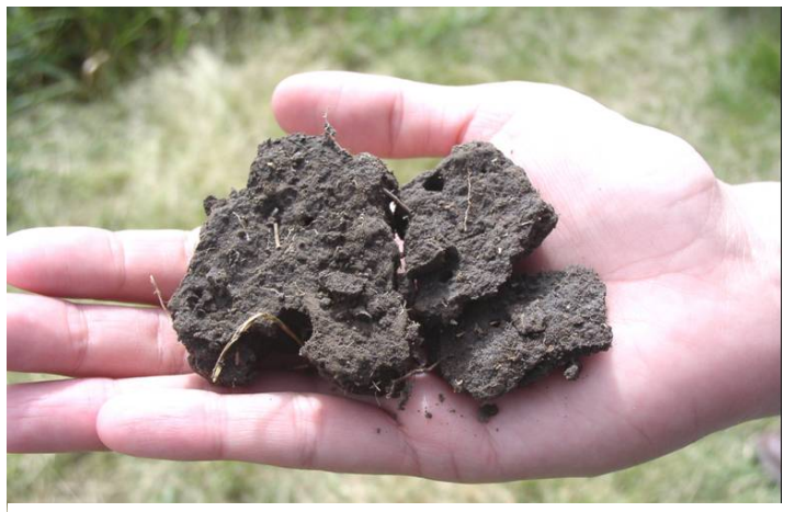
Well structured, well drained Palouse Silt Loam soil.

Suitable soils for seeding are loams, silt loams, and clays, or a combination of materials mixed