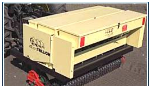
Trillion Seed Broadcaster.

Seeding methods must be suited to the site, environment, seed, and available equipment. Drill seeding is generally limited to slopes less than 3:1. Good drills, when properly adjusted, will distribute the seed uniformly and at the proper depth. Less seed per acre is required for drill seedings than other seeding methods. Drilling is slow compared to aerial or broadcast seeding, but wherever it is possible to drill the advantages outweigh the disadvantages.