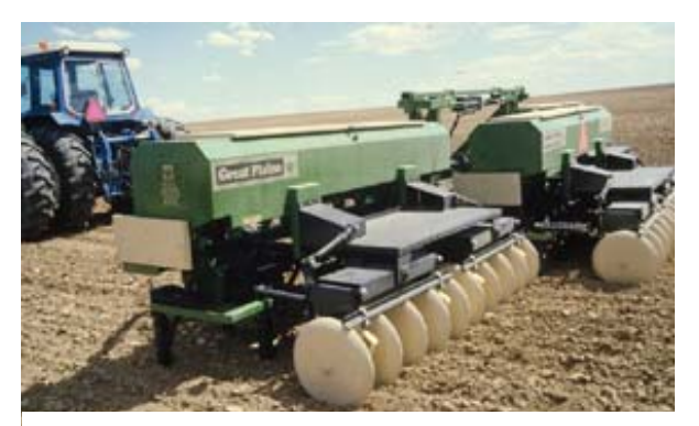
Great Plains Seed Drill.

Chemically prepared seedbeds should be considered for sites that are unsafe and/or impractical to mechanically prepare. Herbicides are used to control unwanted vegetation. A survey of the existing vegetation of the site needs to be completed early in the planning process. This will help determine which herbicide is needed, safe plant-back period, and types of vegetation to use. In many cases a chemically prepared seedbed will result in a poor quality seedbed. Seed safe sites will be lacking, rodents and birds will predate upon the seeds, and mineral soil will not be exposed. Transplanting vegetation should be considered. While transplanting is costly, it can be very efficient.