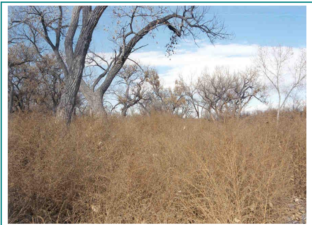
This photo shows a dense stand of the annual weed Kochia that proliferated after the removal of saltcedar in the Middle Rio Grande Bosque.