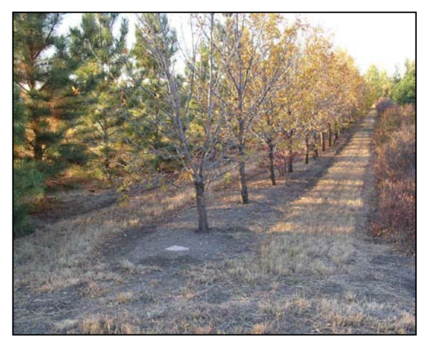
When fabric is not used, weed control can be handled by tillage (hand hoeing or rotary tree cultivation), mulch, or herbicides. Glyphosate works well when trees are larger and not as sensitive to herbicide drift.