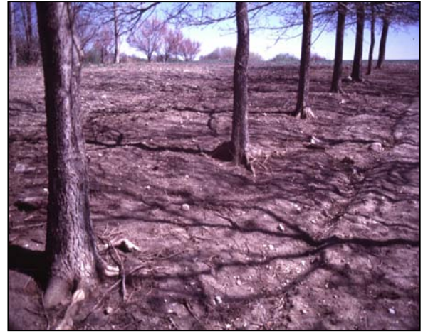
Tree roots can be damaged by tillage and erosion.