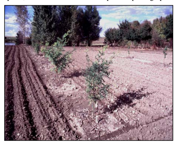
Frequent tillage may cause soil erosion.

Fabric Mulch Plantings: Seeding warm-season grass between the fabric strips soon after tree planting is desirable to prevent weed competition, especially from invasive species such as Canada thistle and wormwood. Tillage is also an option, but care must be taken to prevent pulling up the edges of the fabric.