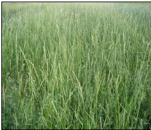
Fig. 1. Binary mixture of 'Newhy' RS wheatgrass and Travois alfalfa.

The Bismarck Plant Materials Center (PMC) seeded a demonstration planting in Perkins County, South Dakota, to observe and evaluate selected legumes and cool-season grasses, and provide an outdoor classroom for educating field office staff and landowners on the benefits of binary