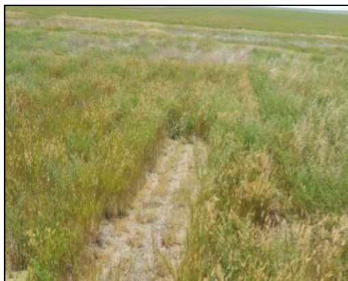
Fig. 2. A 2-ft x10-ft swath was harvested from each plot for dry matter yield.

The demonstration planting was evaluated annually from 2008-2013. Stand ratings of the legume and cool-season grass cultivars were determined by visual observation at the beginning of each growing season, from 2008-2013. Yield was determined in late July-early August in 2009, 2011 and 2012 by harvesting 2-ft x 10-ft swaths that were representative of the stand of the legume and perennial grass within each plot (Fig. 2). Harvest dates were based on once-per-season cutting. This timing was less than optimum for capturing high forage quality, resulting in lower quality than what would be expected from an earlier and more typical harvest date. Forage quality data was collected from the sampled plots in 2012 only.