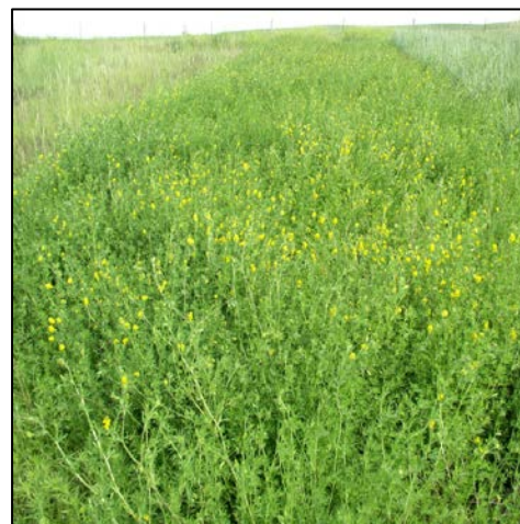
Fig. 4. Sholty yellow alfalfa plot between the mixed plots of green needlegrass and pubescent wheatgrass.

Forage yields of the legume and legume-grass mixtures varied depending on year and yield contribution of each component in the mixture (Table 1). Plots with alfalfa had the best and most consistent yields. Sholty alfalfa yields were exceptional, and it was the most competitive legume when mixed with a grass (Fig. 4). The plots with Travois alfalfa also produced good yields, and appeared to perform even better when mixed with a cool-season grass. Most of the grasses maintained a good stand in the Travois-grass mixed plots ( Travois alfalfa was impacted in some years from grasshopper predation which negatively affected both yields and quality ). Cicer milkvetch did not perform as well as the alfalfas at this site. It did not compete well with most of the grasses, but maintained a fair stand where it was seeded alone. The sainfoin performed poorly and did not persist in any of the plots. By the 6 th year, yields for sainfoin plots were provided by the grass component only. Intermediate wheatgrass, meadow brome, and crested wheatgrass were the most productive and consistent performers of the cool-season grasses, and competed best with the legumes, including the Sholty alfalfa. Meadow brome, western wheatgrass, green needlegrass, and Russian wildrye also yielded well in most of the legume combinations.